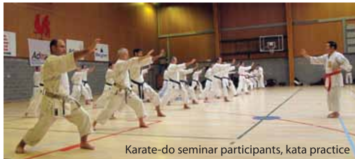
Karate-do seminar participants, kata practice