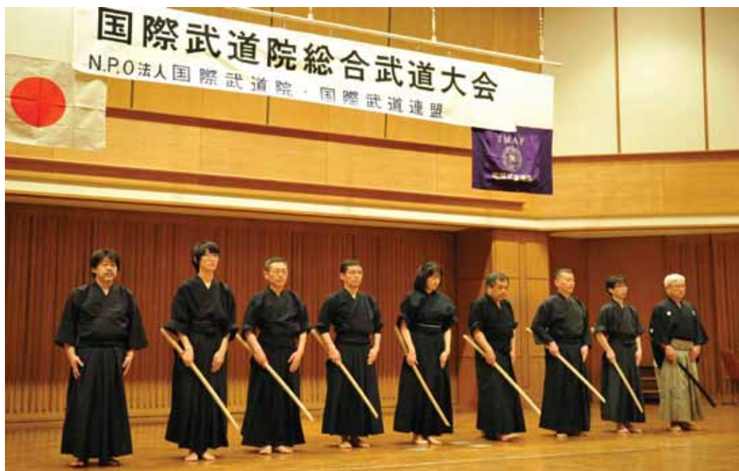
Kobudo division exhibition participants

The 34th All Japan Budo Exhibition was held April 29th and featured leading Japanese and international practitioners from all Kokusai Budoin, IMAF divisions.