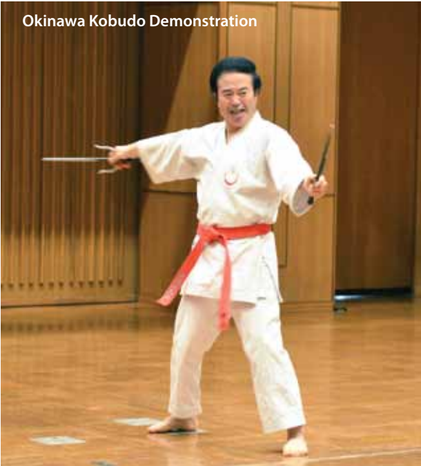
Okinawa Kobudo Demonstration