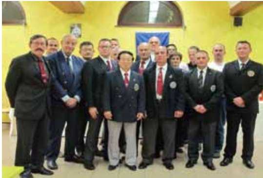
International and HQ representatives

Each year HQ Japan and international officers meet to discuss current events and future initiatives for worldwide activities.