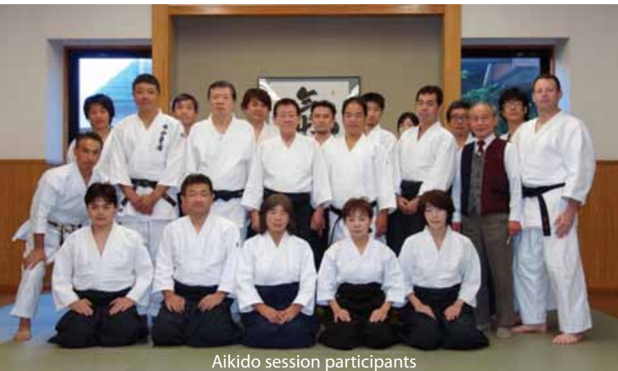
Aikido session participants